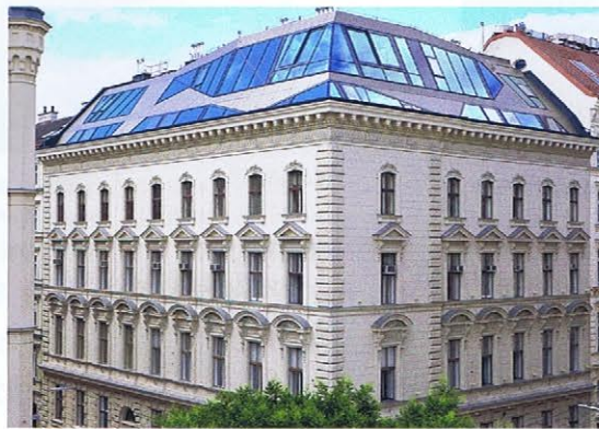
The roof of the Bösendorferstrasse complex features Alucobond as a material

Many new penthouses followed, demonstrating Penthouse Construction's attention to high-value solutions. Today, the company is among the top three construction companies specializing in penthouse construction. “In Vienna, there are more than 40,000 attics in houses from the 19 th century, all of them ideal for penthouse conversions,” says Mr. Fohrafellner. “We realize about one to two pro-